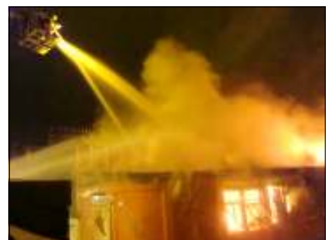
You don't want to have to wait for fire engines!

How does reducing your Fire Cover 'Improve Your Safety'? Quite Simply - It Doesn't!